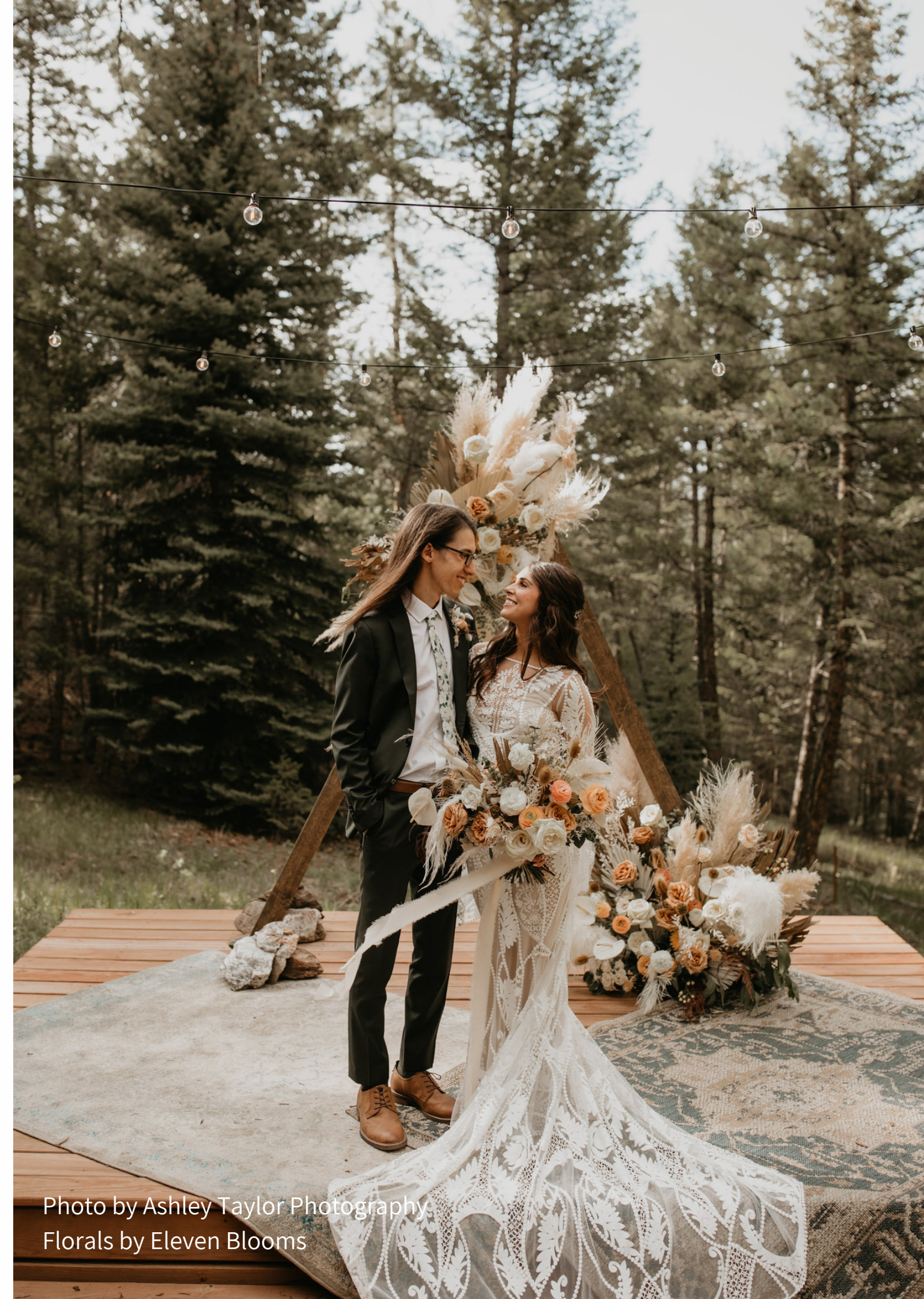
Florals by Eleven Blooms