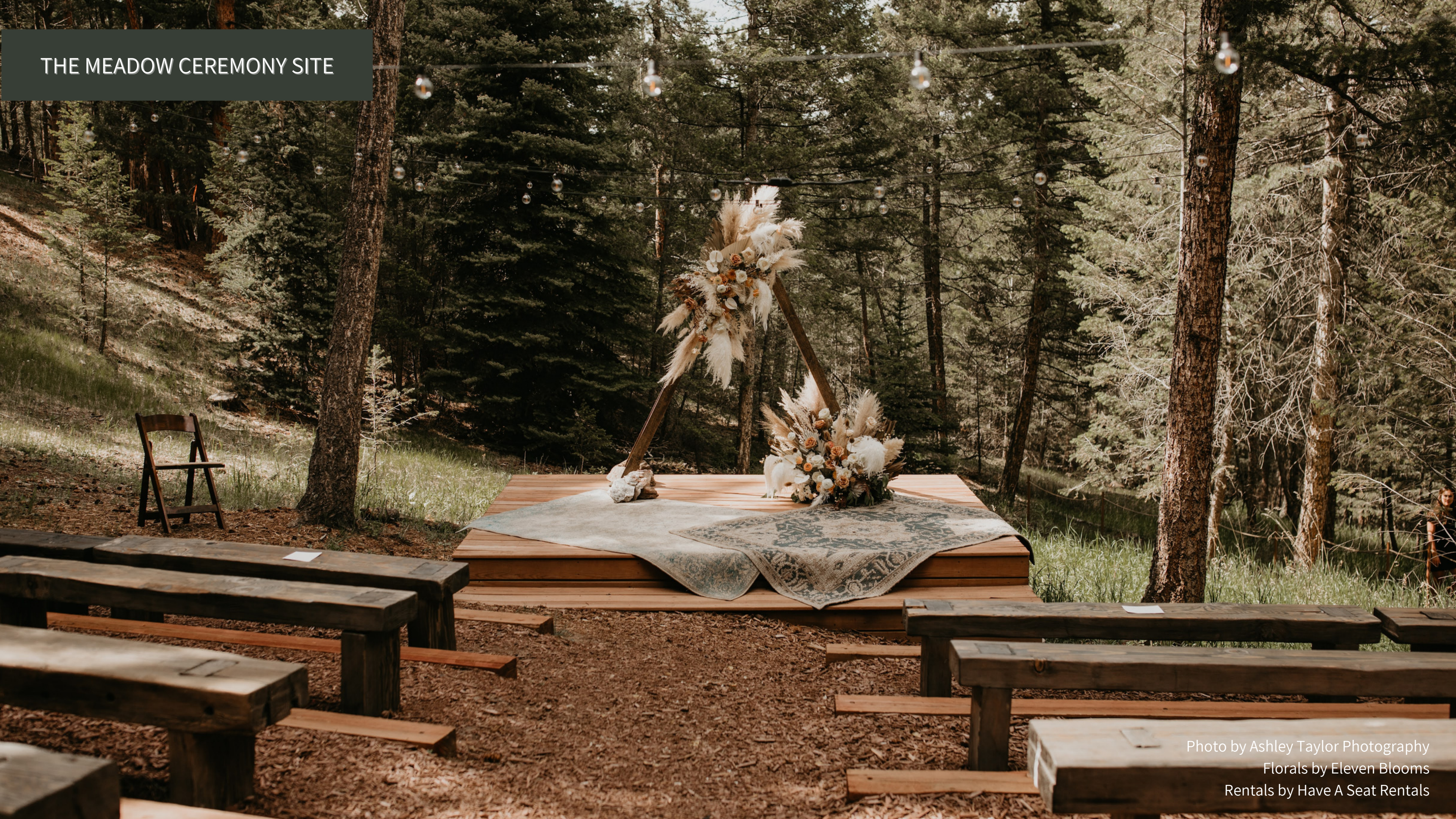
Florals by Eleven Blooms Rentals by Have A Seat Rentals