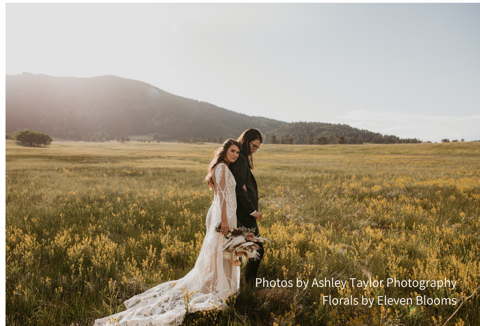
Florals by Eleven Blooms