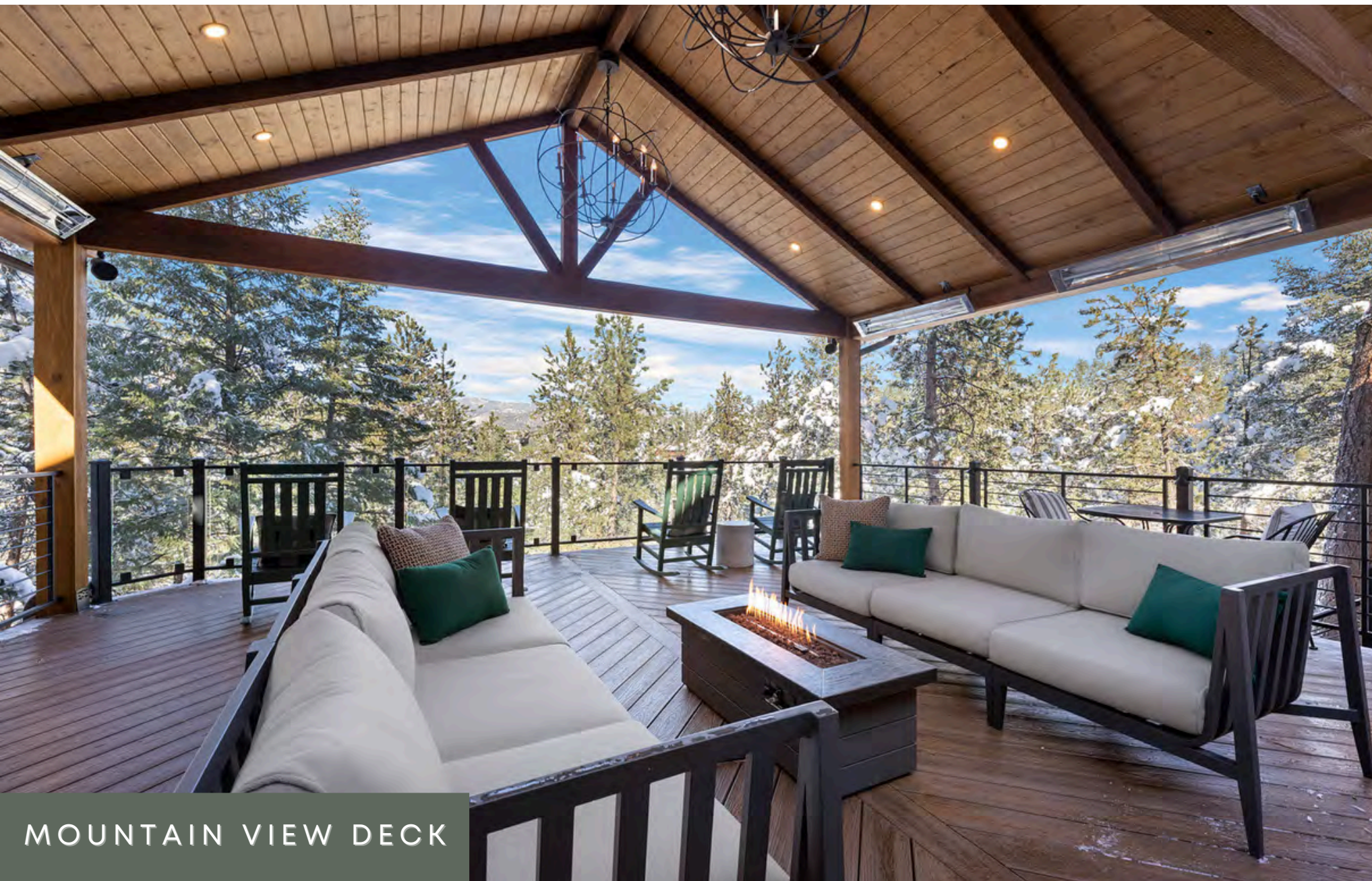
MOUNTAIN VIEW DECK