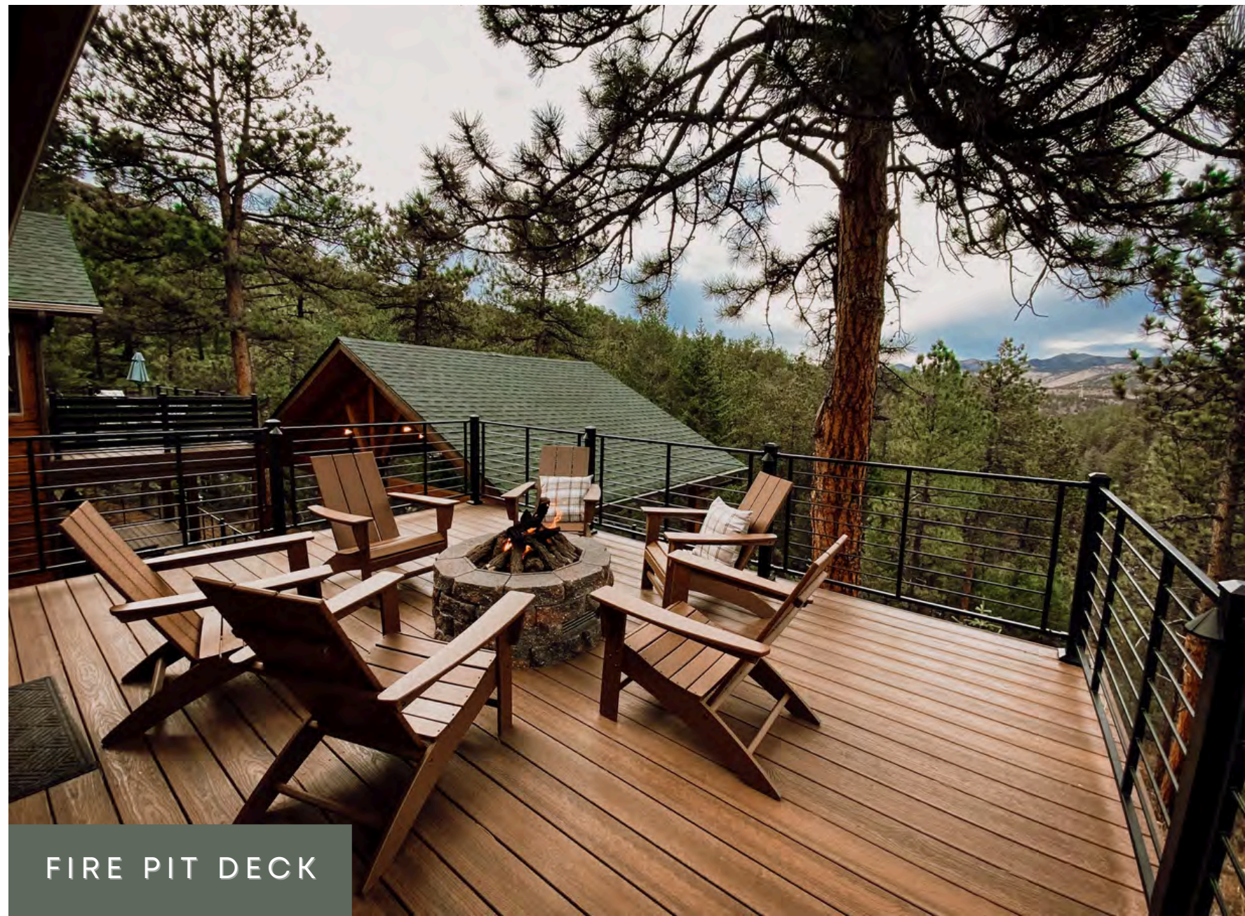
FIRE PIT DECK