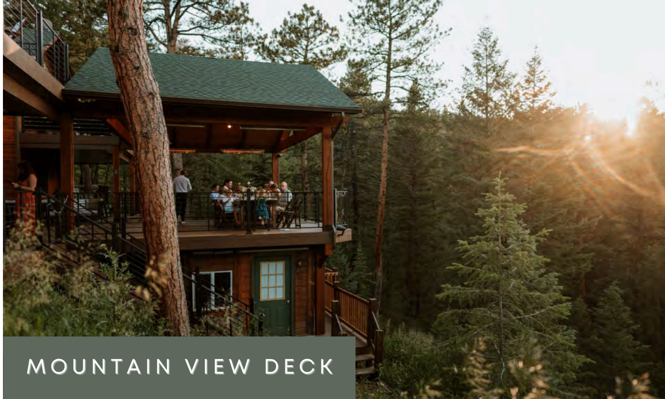
MOUNTAIN VIEW DECK