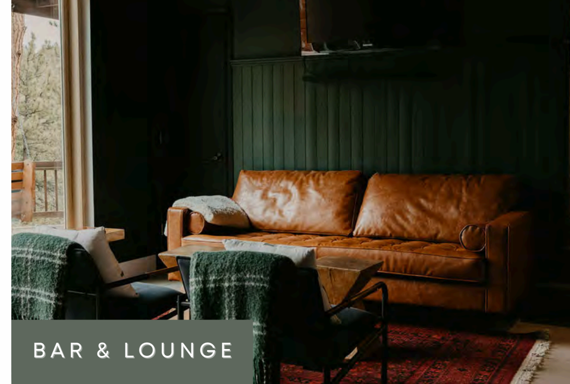
BAR & LOUNGE